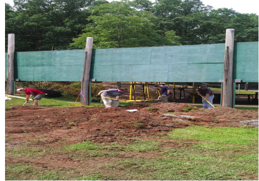
R and P volunteers working on storm sewer