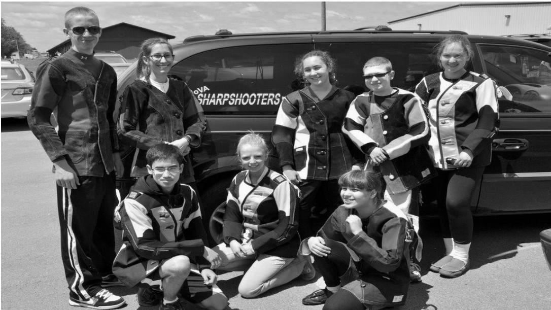
Memories from Camp Perry