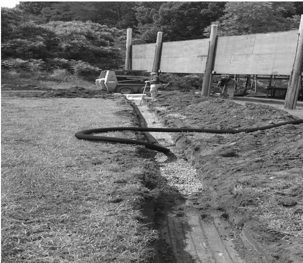
Installing storm water system at R and P Range

More pictures from work being done at the chapter