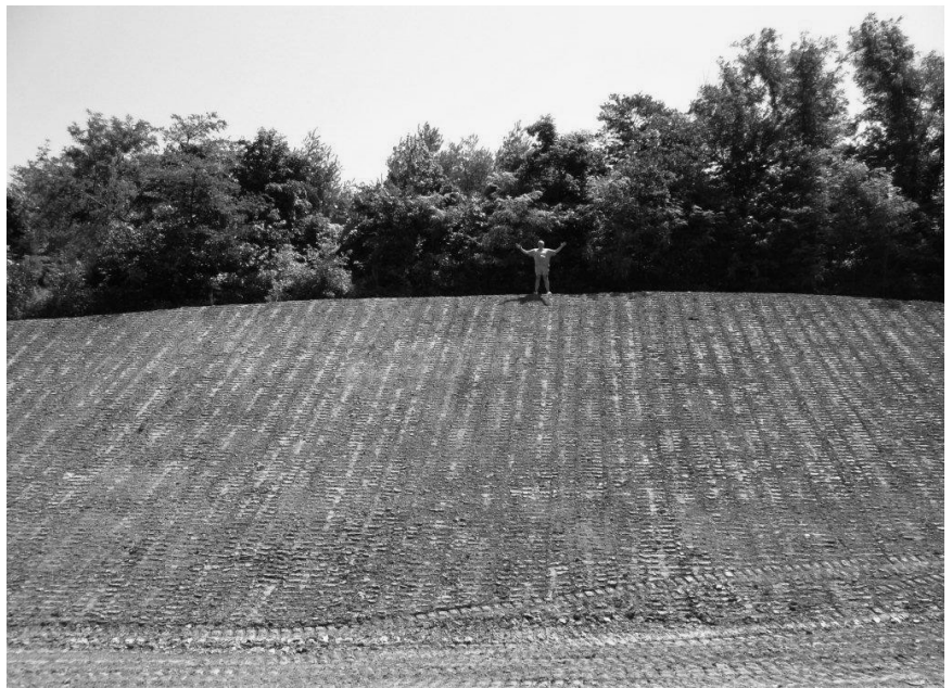
Randy Handcock on top of the world

More pictures from work being done at the chapter