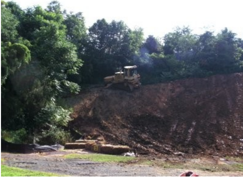
Dozer on top of bream at R and P Range